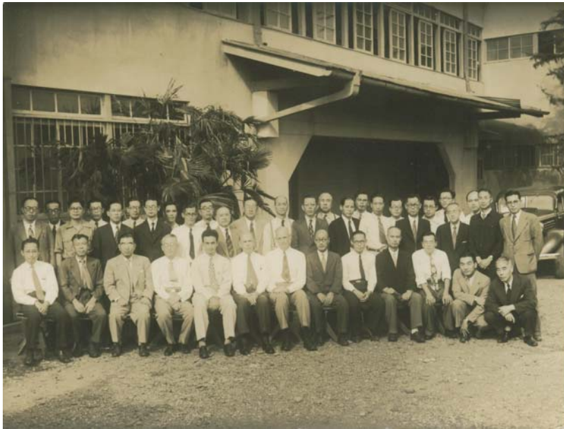
Figure 1. Participants in the first CCS Seminar Class, photographed at Waseda University, Tokyo in September 1949. The reverse side of the photograph identifies the participants.